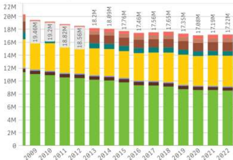
Development of the number of people employed in selected sec... (number of people employed)